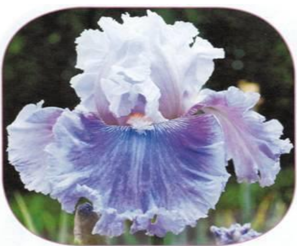
FRILL OF IT ALL